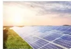
Energy Storage System