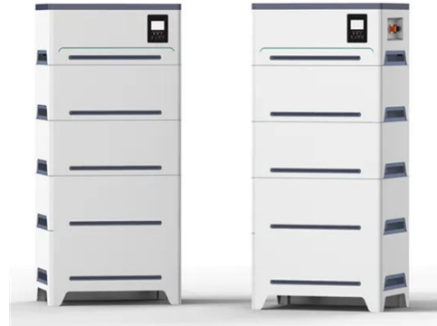
Photo: Solar Energy Storage