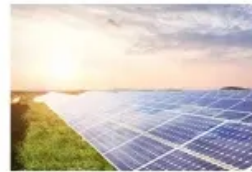
Energy Storage System